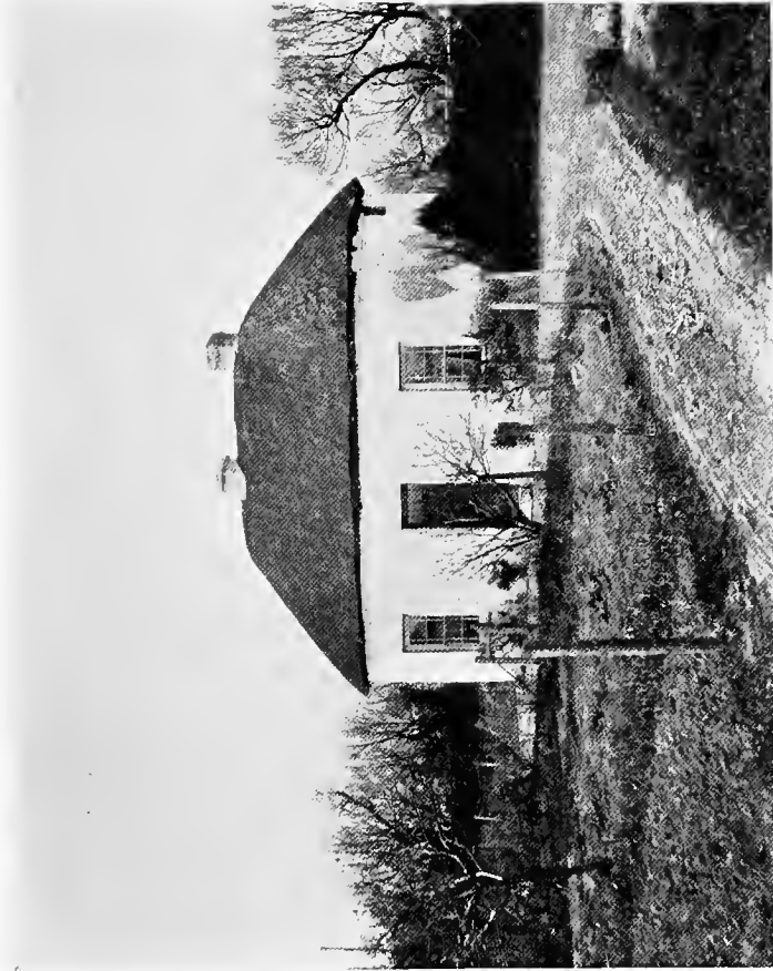
SWIFT'S HOUSE, KILROOT